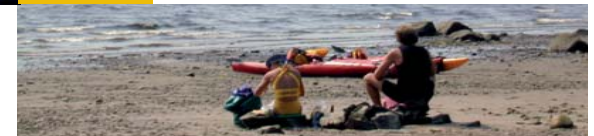
Kayakers resting

Zoning is a management tool designed to protect the marine park's ecosystems and plant and animal life, while promoting an environmentally sustainable use of the park and a quality visitor experience. The marine park's first management plan outlined a general zoning plan. The present zoning proposal is more specific in terms of the zones and the activities permitted in each zone.